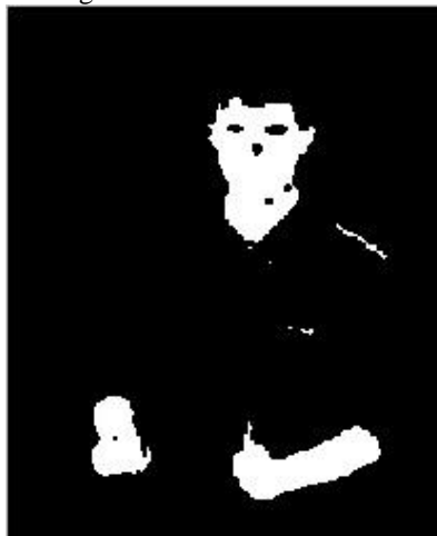
Figure 2 Result after morphological filtering

The command imfill fills holes in the binary input image inp and produces the output image outp . Applying this operation allowed the missing pixels of the detected face regions to be filled in. Thus, it made each face region appear as one connected region.