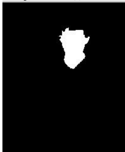
Figure 3. Result after area-based filtering

These two commands performed the following tasks (1) look for the connected regions whose areas were of 26% of the largest area and store their corresponding indices in face_idx (2) output the image face_shown that contained the connected regions found in (1).