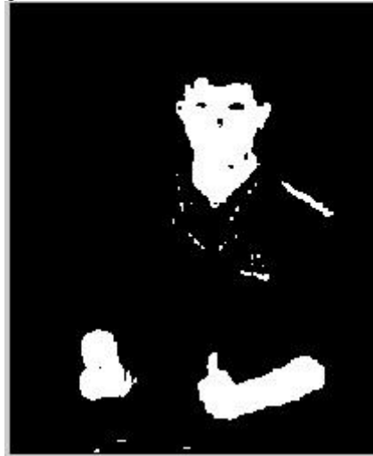
Figure 1 Result after thresholding

As seen in fig 2, the blue channel had the least contribution to human skin color. Leaving out the blue channel would have little impact on thresholding and skin filtering. This also implies the insignificance of the V component in the YUV format. Therefore, the skin detection algorithm using here was based on the U component only. Applying the suggested threshold for the U component would produce a binary image with raw segmentation result, as depicted in fig 1.